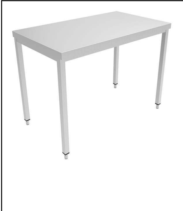
134002 (GTG1200E) Work table, 1200mm